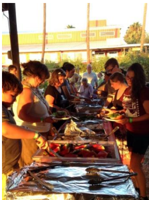
Guests lining up for the dinner line at Murray Family Farms