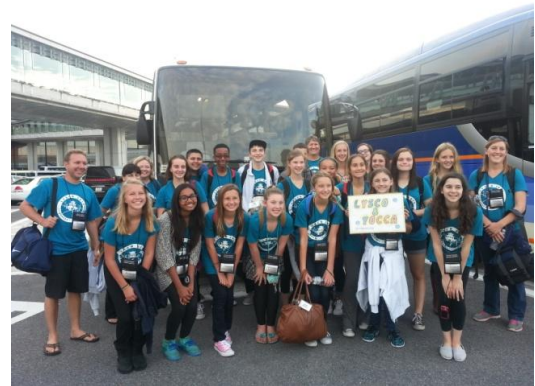
Just after arriving in Japan!