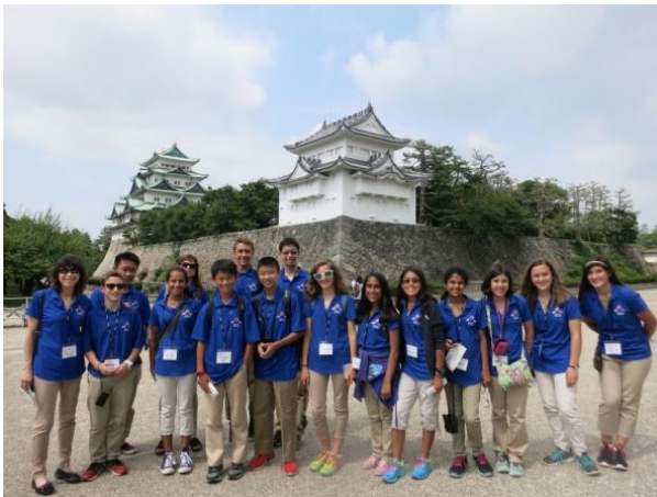
Cupertino delegation posing in front of Nagoya Castle

The Cupertino-Toyokawa Sister Cities Student Delegation of 14 middle schoolers and two chaperones had a fabulous experience in Japan from June 24 – July 3, 2015. We were greeted warmly by our host families. We came as strangers and left as life-long friends. We were totally immersed in Japanese culture. We visited many shrines, temples, and festivals. We ate wonderful food and became experts with chopsticks! Our Toyokawa hosts gave us awesome happi coats as a parting gift. We also explored Nagoya, Nara, and Kyoto.