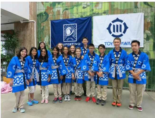
Cupertino students trying on happi from Toyokawa

It was an adventure of a lifetime! Thank you Toyokawa and the Cupertino-Toyokawa Sister Cities Committee for making our experiences very memorable. We look forward to the end of September when our Toyokawa friends will visit Cupertino!