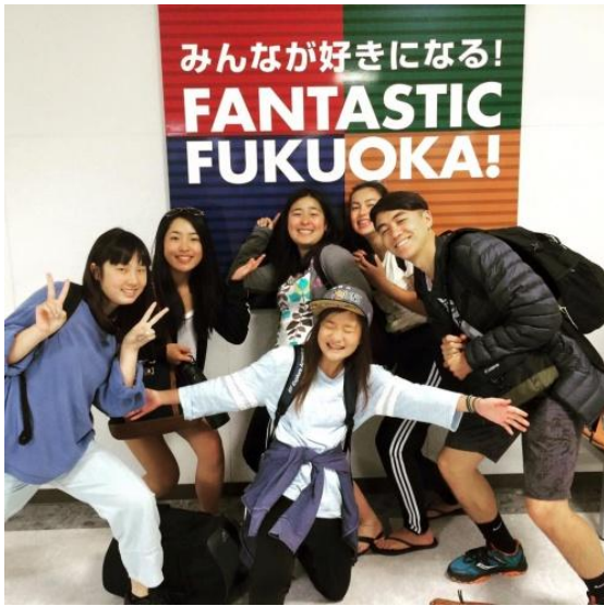
Students with their host families

This past July, the Oakland-Fukuoka Sister City Association sent two delegations of junior ambassadors to Fukuoka from Oakland.