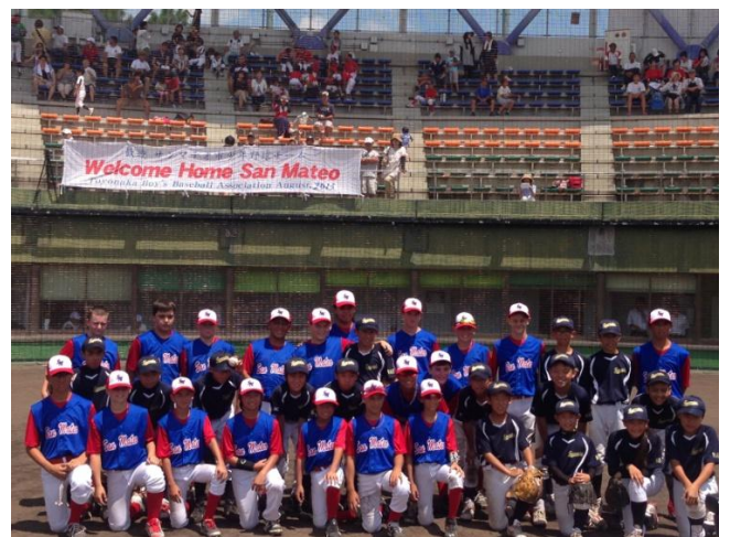
Above: San Mateo and Toyonaka teams after a game; Below: San Mateo team at City Hall