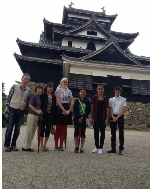
Santa Clara students with their host families

We toured Matsue Castle, made traditional Japanese paper, hiked along a gorge, visited a local pottery studio, tried on dozens of formal kimono, visited the culturally significant Izumo Taisha, and enjoyed the natural beauty of the Shimane coast.