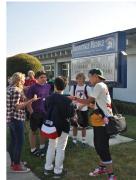
The morning of goodbyes

Now in its second year in operation, Sunnyvale Sister City Association (SSCA) sent eight slightly nervous but excited Sunnyvale students to Iizuka on June 18. Our students were immersed in Japanese culture as they visited local historical destinations and spent time with their host families, including visiting the schools and sitting in the same classes with them. Despite the language barrier, they became quick friends and many continue to keep in touch through e-mails and Skype.