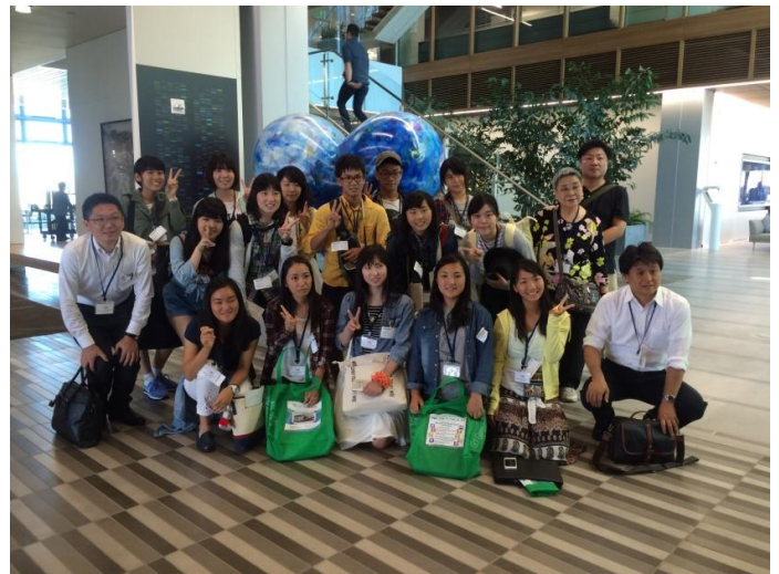
Delegation from Kishiwada

They also got to visit the Genentech Campus and ride the ferry to downtown San Francisco where they visited the Exploratorium and Pier 39. They performed a play for us at the reception dinner and also sang a song in English.