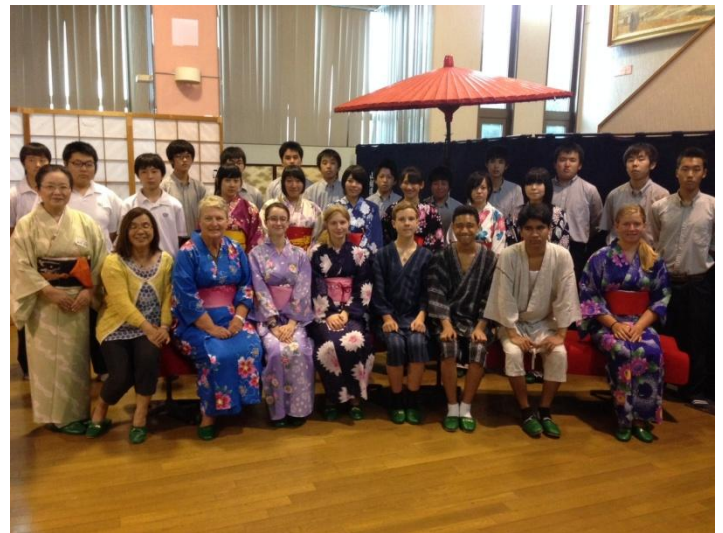
Fairfield students trying a little Japanese culture in Nirasaki

For the 28 th year, the City of Fairfield's Sister City Program sent a group of high school students to our sister city, Nirasaki, Japan. The three girls and three boys, along with their adult chaperone/advisor, stayed with host families in Nirasaki, Yamanashi Prefecture, for a three-week visit from July 6 to July 27. The exchange group enjoyed a day trip to Tokyo, visited public schools in Nirasaki, and sampled the delicious peaches, grapes, and other fruit for which Yamanashi is renowned. One of the highlights of their stay was a three-night excursion via bullet train to Kyoto and Hiroshima. Preparations have already begun for this year's December exchange, when six Nirasaki students will visit Fairfield during the holiday season.